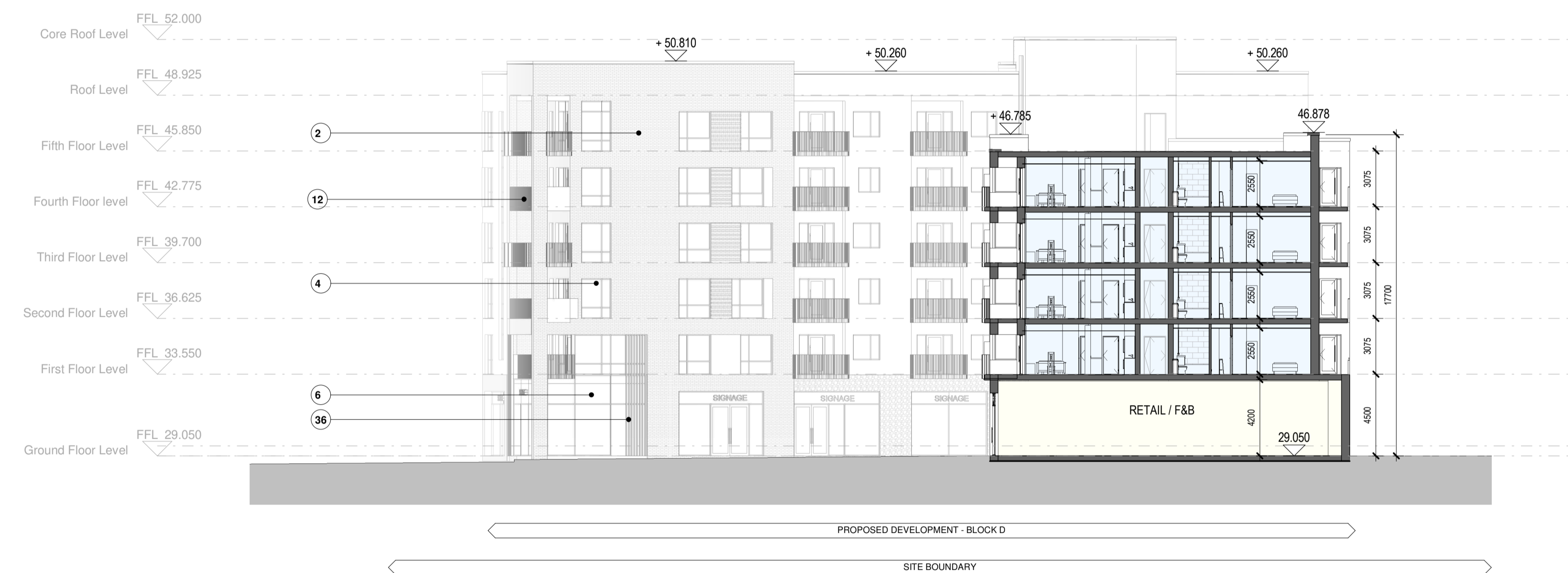
2 BLOCK D - SECTION BB 1 : 200

Notes: DO NOT SCALE FROM THIS DRAWING. USE FIGURED DIMENSIONS IN ALL CASES. VERIFY DIMENSIONS ON SITE AND REPORT ANY DISCREPANCIES TO THE ARCHITECTS IMMEDIATELY. THIS DRAWING TO BE READ IN CONJUNCTION WITH THE ARCHITECTS SPECIFICATION. © THIS DRAWING IS COPYRIGHT AND MAY ONLY BE REPRODUCED WITH THE ARCHITECTS PERMISSION.